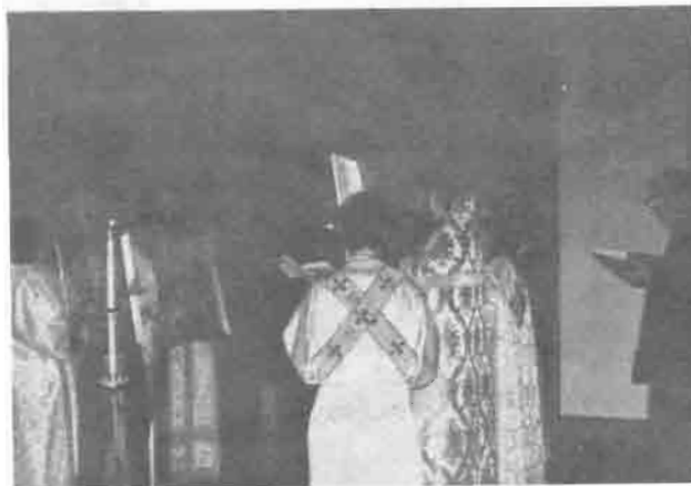
Triumph of Orthodoxy Vespers