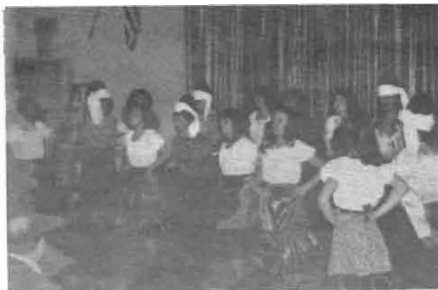
The SOYO Dabke Dance Troupe